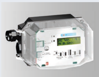
Reliable in operation and inexpensive to maintain due to the proven, economical piezo technology