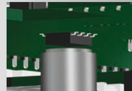
Contactless and precise stroke determination with the Hall sensor enables wear-free use even in harsh conditions