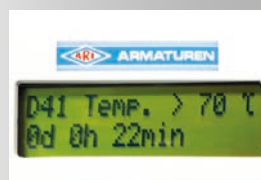
Fast access to diagnostic data such as temperature violations