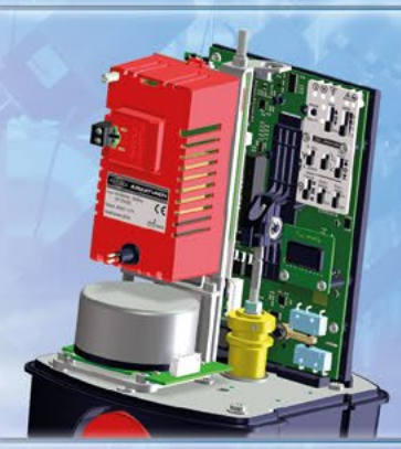
Optional: Switched-mode power supply, e.g. for 115 V or 230 V, available as a separate retrofit